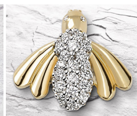
SMALL BEE FABULOUS DIAMOND PIN