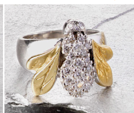
BEE FABULOUS DIAMOND BEE RING