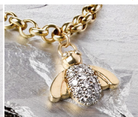
BEE FABULOUS DIAMOND BEE CHARM (2ND YEAR)