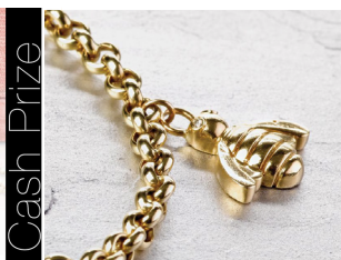
BEE FABULOUS CHARM BRACELET (1ST YEAR)